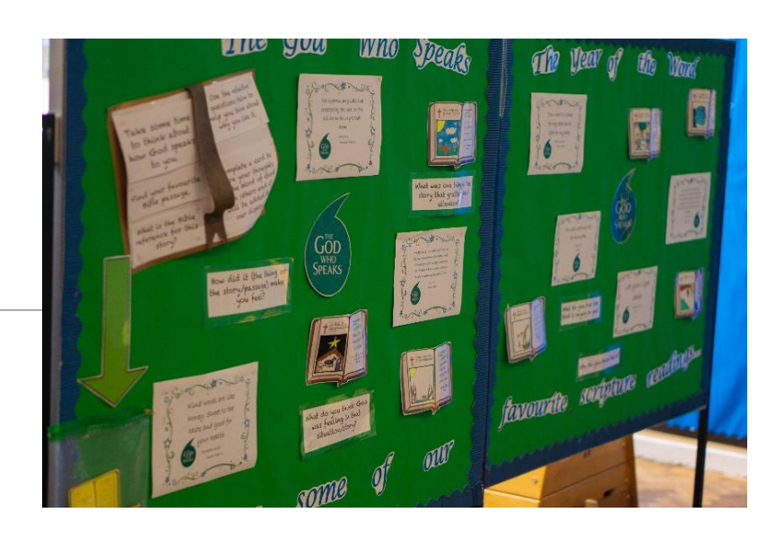
Displays in the school hall enable the children to take inspiration from saints and our Gospel Values