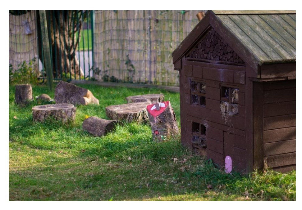
We have a Forest School. Children across the school enjoy learning life skills and develop strategies to improve their mental and emotional health